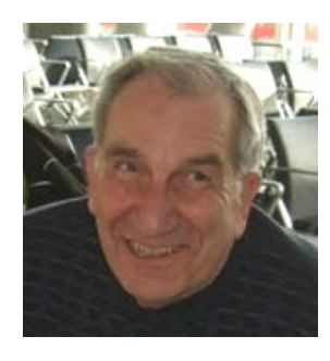
Garfield Portch Vincent Graves Greene Foundation (Canada)