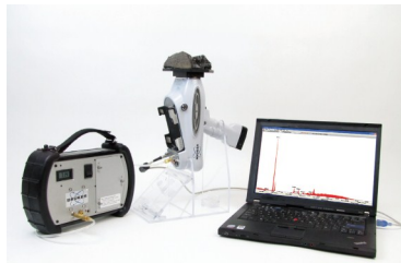
The Bruker Tracer III-SD with its vacuum pump and dedicated computer

While being trained to use the Bruker Tracer III-SD in November, members of the IAP team performed various analyses on stamps they had brought. While these were primarily intended to provide practice for the team, several very nice results were obtained that show the power of this analytical tool.