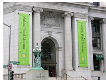
Venue for the IAP/NPM International Congress Washington, DC

Because of facility space limitations, attendance will be limited to 35. IAP membership is not required to attend. §§