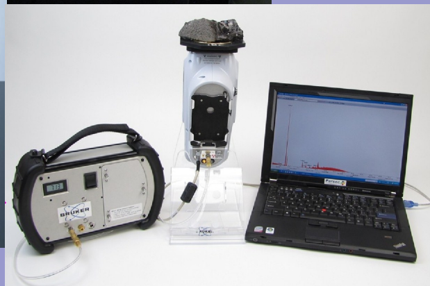
Bruker Tracer III-SD XRF